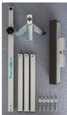
Figure 1: Wingstand parts.