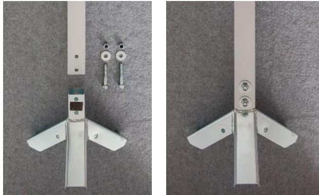
Figures 2 and 3: Showing the steel tripod and extendable profile before and after assembly.

Screw-in the steel tripod to the extendable stem. Use 2 screws, 2 washers (24 mm) and 2 nuts.