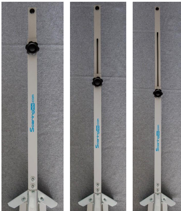
Figures 10 – 12: Showing a different heights of the wingstand.

Step 3: Extend aluminium stem and set the appropriate height of the wingrest which varies from glider to glider. To lock the aluminium stem at the right height tighten the screw on the side of the stem with your hands.